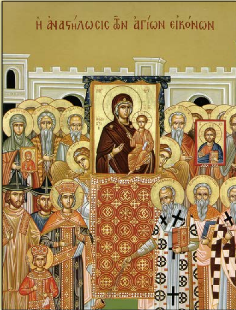
Icon of the Holy Images