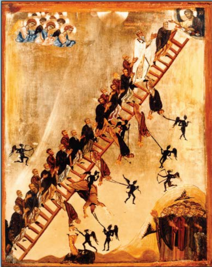
Icon of the the Ladder of Divine Ascent